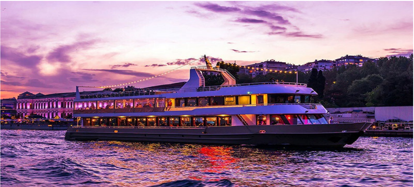
Day: 6:Istanbul Tour End