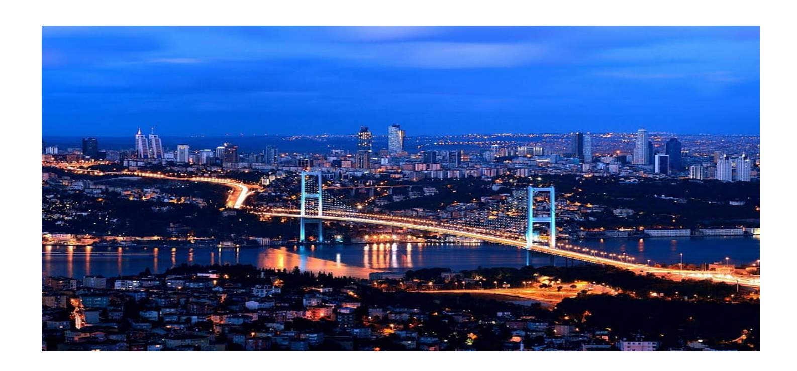
Day: 2:Full Day Istanbul City Tour