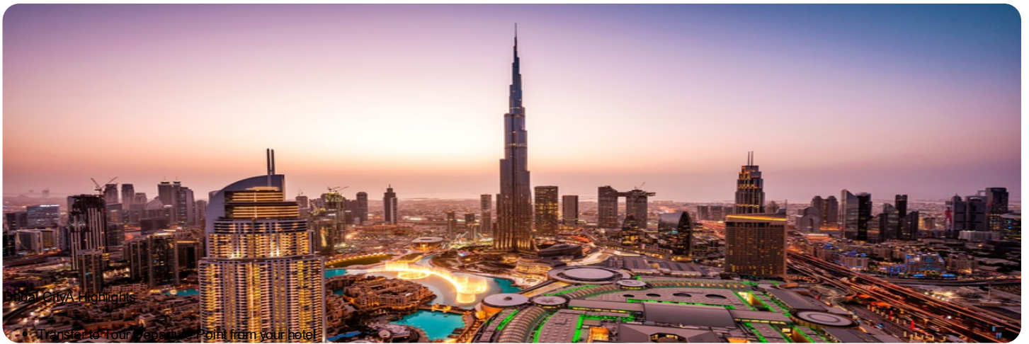
Dubai City Highlights