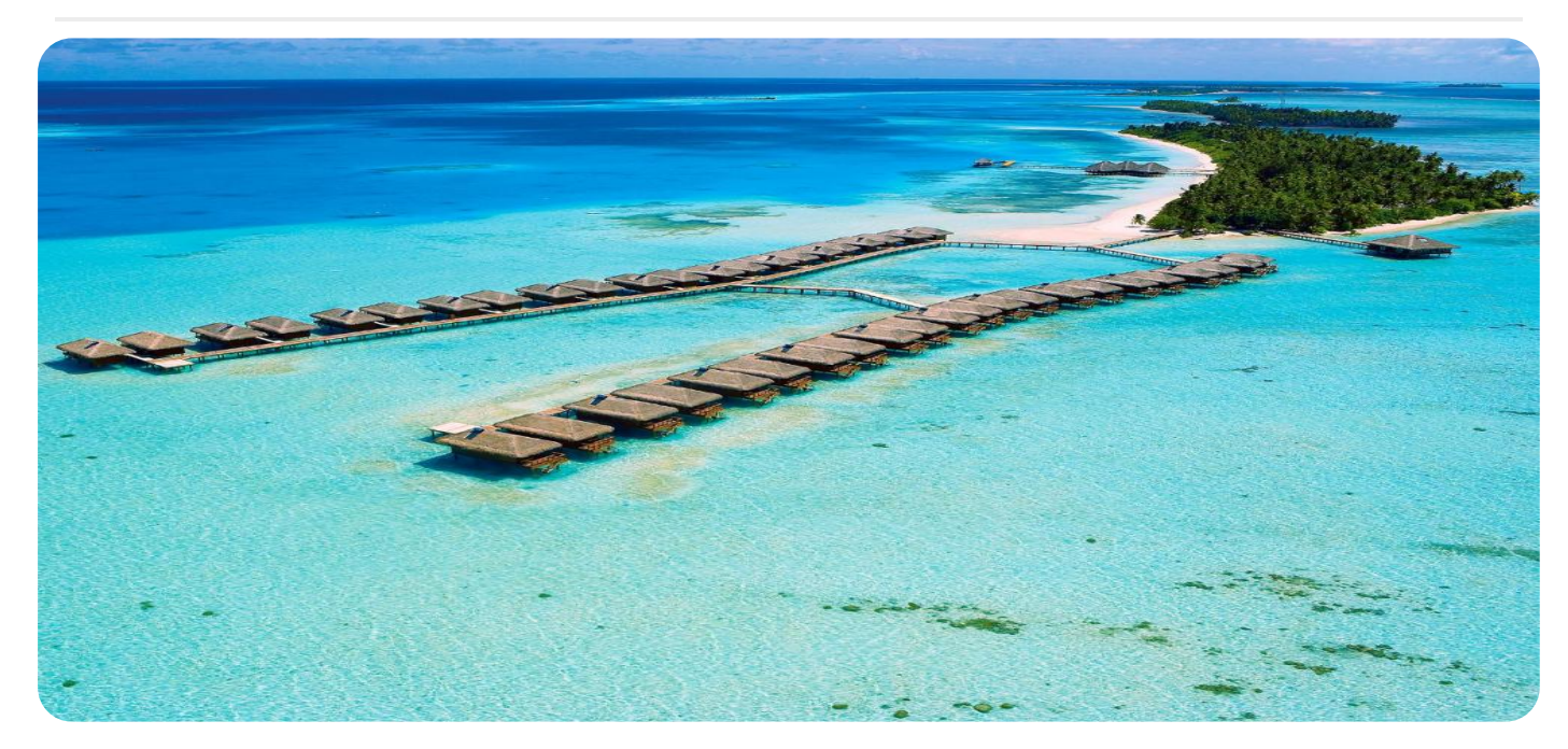
Day: 3:Day at Leisure, Transfers to Water Villa