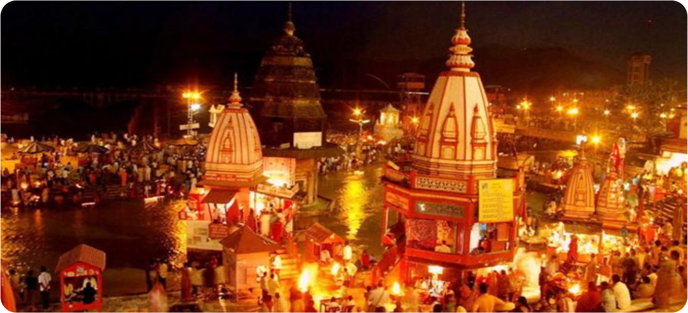
Visit Kumbh Mela