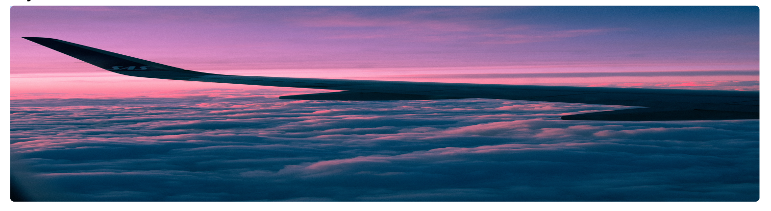
Day: 5: Maldives

After breakfast at the resort, day free to relax and explore the resort or experience one of the great Spa treatment (at an extra cost). Lunch at the resort. Dinner at the resort.