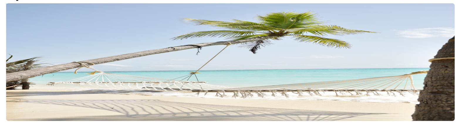
Day: 2: Maldives

On arrival at the Maldives International airport you will be met by the resort's airport representative and will be transferred to the Resort by a speedboat ( shared basis ) ,Lunch at the resort . Afternoon free for relaxation then Dinner at the resortOvernight stay at the resort . (Meals as per meal plan chosen)