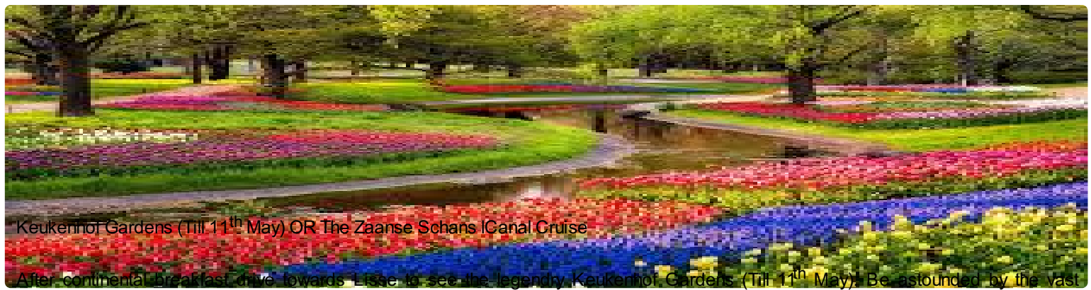
Keukenhof Gardens (Till 11 th May) OR The Zaanse Schans | Canal Cruise

After continental breakfast drive towards Lisse to see the legendary Keukenhof Gardens (Till 11 th May). Be astounded by the vast numbers of Tulips, daffodils and hyacinths, that creates dazzling ranges of color.